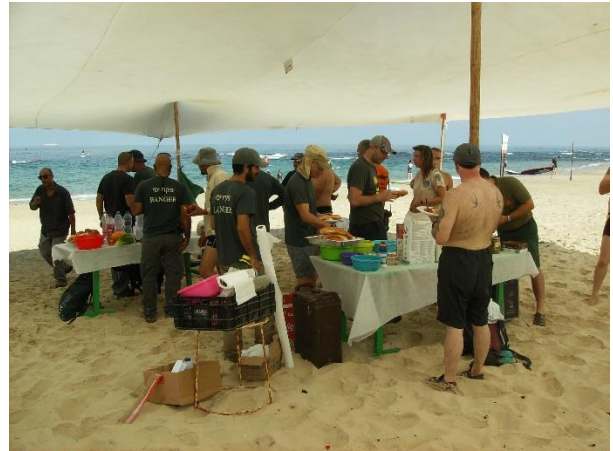
A boat trip id the Marine Unit.